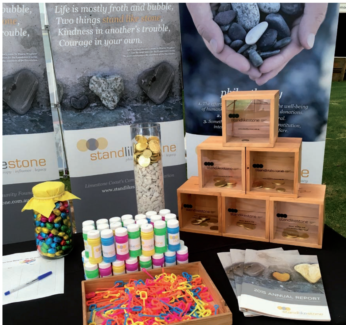
Stand Like Stone's 2016 South East Field Days stand.

As part of our community relations strategy, Stand Like Stone attended the South East Field Days in Lucindale in March. The Field Days present a unique opportunity to mingle with people from the Limestone Coast and have conversations around the region, the foundation and our activities. As per previous years, we had bottles of bubbles to give to local children, along with bookmarks and and a “Guess How Many” lolly jar. There were high levels of social media interaction over both days, including twitter conversations and postings on both our facebook page and the SE Field Days facebook page.