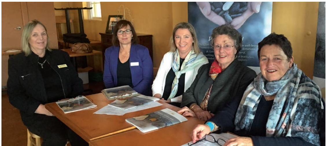
The board members of the Stand Like Stone Foundation

The Strategic Plan for 2016-2019 is ambitious. It aims to be inclusive and to grow networks and relationships across the Limestone Coast. It is innovative in its approach to fundraising and capital contributions and is driven by a passion to provide for a better and more caring community. The Strategic Plan will be the essential driver for the Board and Stand Like Stone Executive and by providing funding for charitable projects and scholarships, Stand Like Stone will grow its reach and positive impact in the region. To obtain a copy of the 2016-2019 Strategic Plan visit www.standlikestone.com.au .