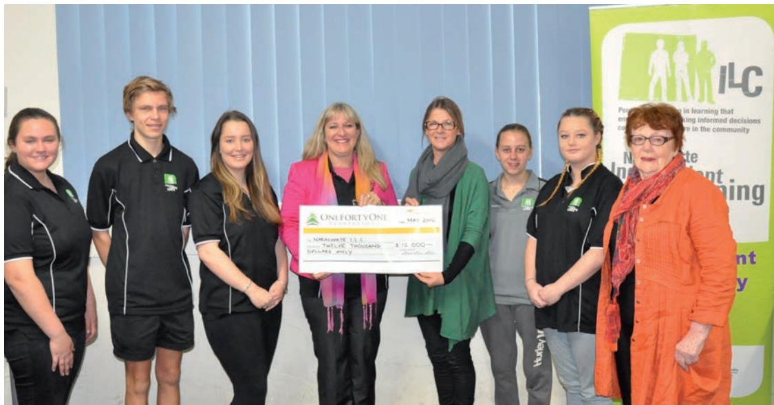
OneFortyOne Plantations Grant Presentation to Naracoorte Independent Learning Centre.

The Naracoorte Independent Learning Centre received $12,000 for “Project Abroad.” This is the second time that the OneFortyOne Community Capacity Building Grants have supported this project, with $10,000 being provided in 2014. This year, twelve students aged between 15 and 74 from the Naracoorte Independent Learning Centre and Naracoorte High School will take part in Project Abroad, which assists students to achieve life-skills, whilst completing SACE credits and culminates in a trip to Cambodia for the participants. The long-term aim of the project is to build leadership capacity and a self-sustainable mentoring group focusing on the wellbeing of youth in the Naracoorte area. Outcomes will include personal growth of participants, including the heightened development of a sense of community spirit and responsibility. This year the project has been expanded to include students from the Naracoorte High School who will utilise this experience as the residential journey of the Gold Duke of Edinburgh Award.