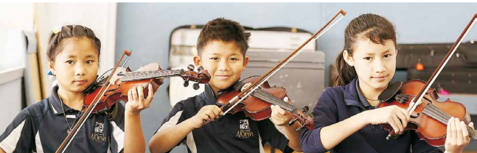
Above: Students from Mount Gambier North Primary who are involved in the 'New Arrivals Strings Program'.

The Penola Primary School received $1000 for their Junior Primary Natural Learning Space project. The Junior Primary Natural Learning Space involves the incorporation of a natural learning space into the playground areas and will include a digging corner, wet and dry rock creek bed, planter boxes, discovery benches, fire pit and teepees. It allows the students to engage outside a traditional learning environment.