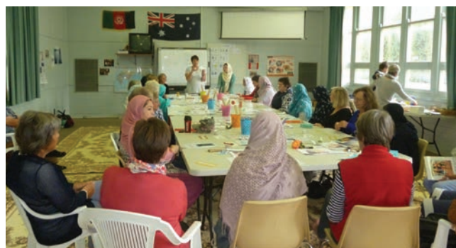
Naracoorte MRC - Talk the Talk (How to talk english)