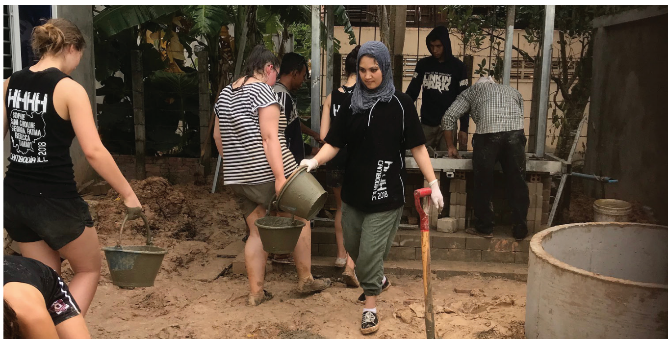
Naracoorte Independent Learning Centre trip to Cambodia

$10,000 was provided to Foodbank of South Australia Inc to assist with increasing capacity of the warehouse in Mt Gambier through the construction of an annexe to accommodate the loading and unloading of produce. The annexe will enable additional space inside the warehouse to increase operations and expand food storage space to increase capacity and deliver to the growing need within the community.