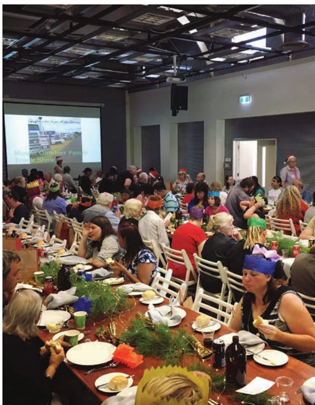
Mt Gambier Community Christmas Day Lunch