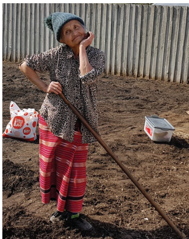
Limestone Coast Migrant Resource Centre Garden