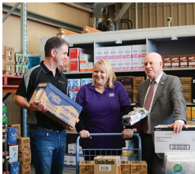
Foodbank Mount Gambier

$8000 was provided to Centacare Catholic Family Services to create a Mobile Toy Library to service the Wattle Range region. The family connections program is a mobile resource family support program that works with vulnerable families with children. The project will bring a mobile toy library to the Wattle Range communities and assist the family connections program to connect with families who may not otherwise have access to early intervention support for their children. The funding will provide for an enclosed trailer to transport toys and resources to the families. Toys will be delivered to homes and libraries, and personnel will assist parents and families with the selection of developmental toys for their children.