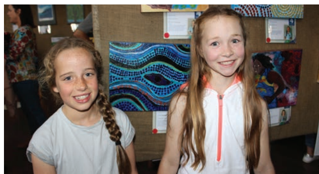
LAS Art Exhibition