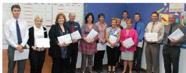
Representatives from Mount Gambier schools receive their Back to School vouchers

Stand Like Stone teamed with Limestone Coast schools that assisted in distributing the vouchers to families in need.